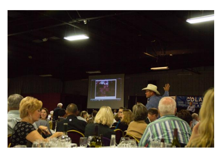
DURING THE AUCTION

The comradery of the evening and expressions of support by so many people are truly inspiring and gratifying.