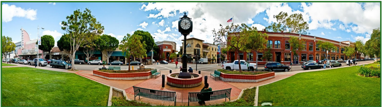
County Lawns in San Luis Obispo (No Water Moratorium Here!)